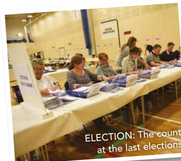
ELECTION: The count at the last elections

The Council is hosting two events to provide further information. These will be held at The Civic Centre, Ridley Street, Redcar, TS10 1TD on Tuesday 13 December at 3pm, and Friday 27 January at 10am. Please email elections@redcar-cleveland.gov.uk if you are interested in attending either of these events. It is also possible to find out more at www.local.gov.uk/be-councillor or www.electoralcommission.org.uk