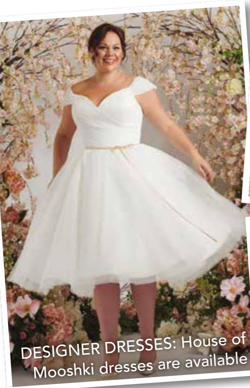
DESIGNER DRESSES: House of Mooshki dresses are available

The project has been funded by the Council's Indigenous Grown Fund. A total of £5.8 million was secured from the Future High Streets Fund, along with £4.5 million from the Tees Valley Combined Authority and £1 million from the Loftus Area Growth Fund. For more information, visit loftusmasterplan.co.uk