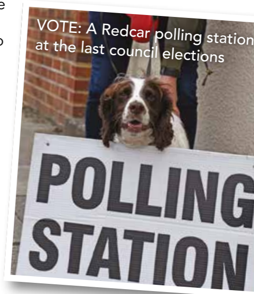
VOTE: A Redcar polling station at the last council elections

Employers must allow councillors to take a reasonable amount of time off to undertake their duties. Councillors are not paid a salary but instead receive an allowance for the duties they undertake. Training,