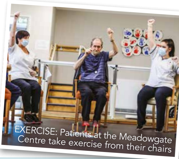
EXERCISE: Patients at the Meadowgate Centre take exercise from their chairs

Chair-based exercises can help to keep people mobile, improve sitting posture and reduce the risk of falls. They can also help people to keep warm and well at home during the winter months by increasing cardiovascular activity.