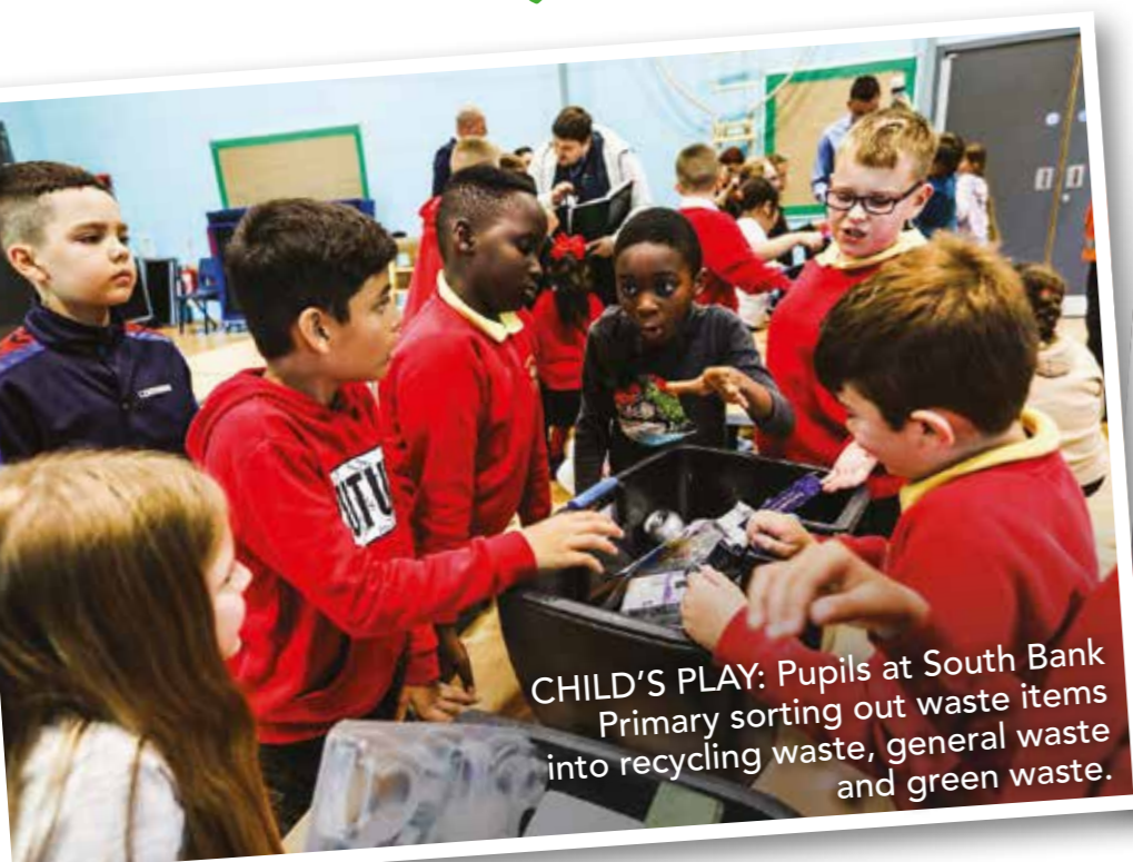
CHILD'S PLAY: Pupils at South Bank Primary sorting out waste items into recycling waste, general waste and green waste.