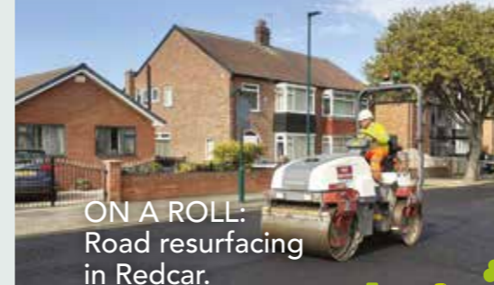
ON A ROLL: Road resurfacing in Redcar.

The Council is also working with other suppliers to drive down the environmental impact of road surfacing works. The Council's contract with Tarmac has reduced emissions of carbon dioxide by 13.78 tonnes per £100,000 of contract spend. This is achieved by using more efficient plant and equipment, reducing travel distances, and improving processes. The Council will work with Tarmac to identify ways to achieve further carbon reductions.