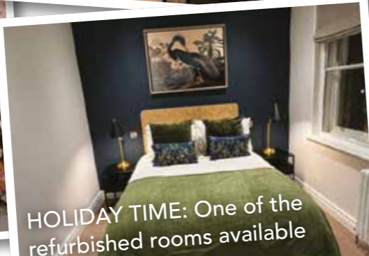
HOLIDAY TIME: One of the refurbished rooms available to rent for holidays