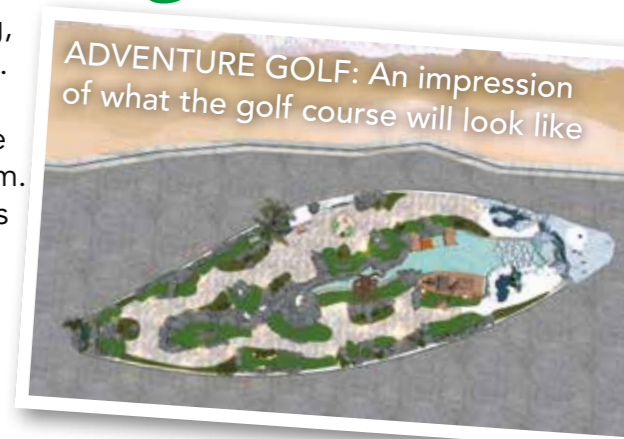
ADVENTURE GOLF: An impression of what the golf course will look like

The adventure golf and play area forms part of the