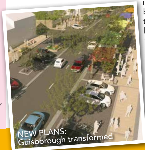
NEW PLANS: Guisborough transformed

To see the plans, please visit: https://redcarcleveland.uk/engagementhq.com/