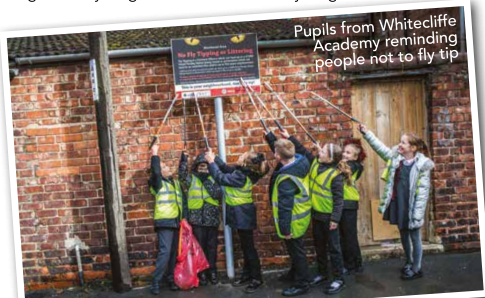
Pupils from Whitecliffe Academy reminding people not to fly tip

She also has a final message for all adults and children in the borough: "Can you please stop fly-tipping and help us keep the planet healthy?"