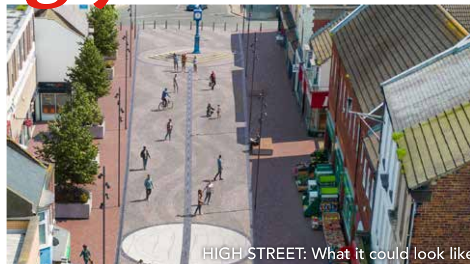
HIGH STREET: What it could look like