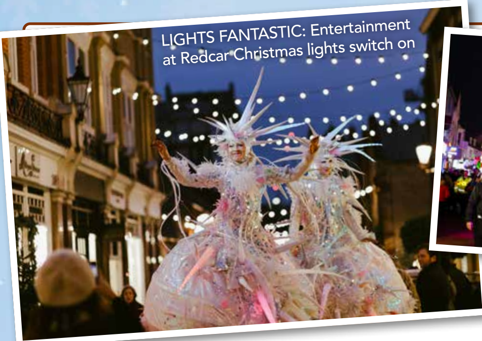
LIGHTS FANTASTIC: Entertainment at Redcar Christmas lights switch on