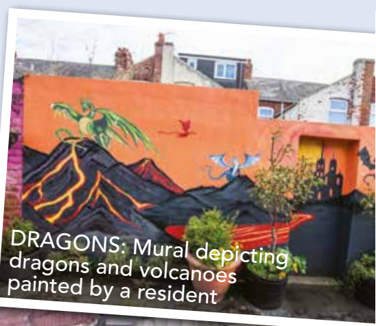
DRAGONS: Mural depicting dragons and volcanoes painted by a resident