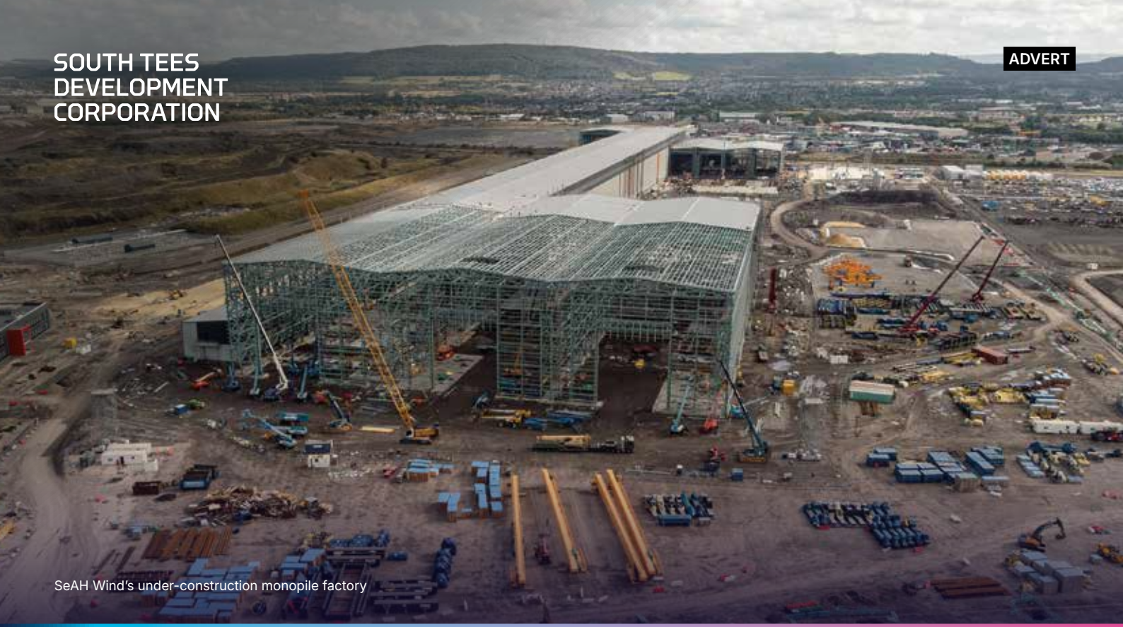
SeAH Wind's under-construction monopile factory