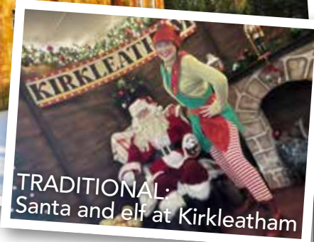
TRADITIONAL: Santa and elf at Kirkleatham