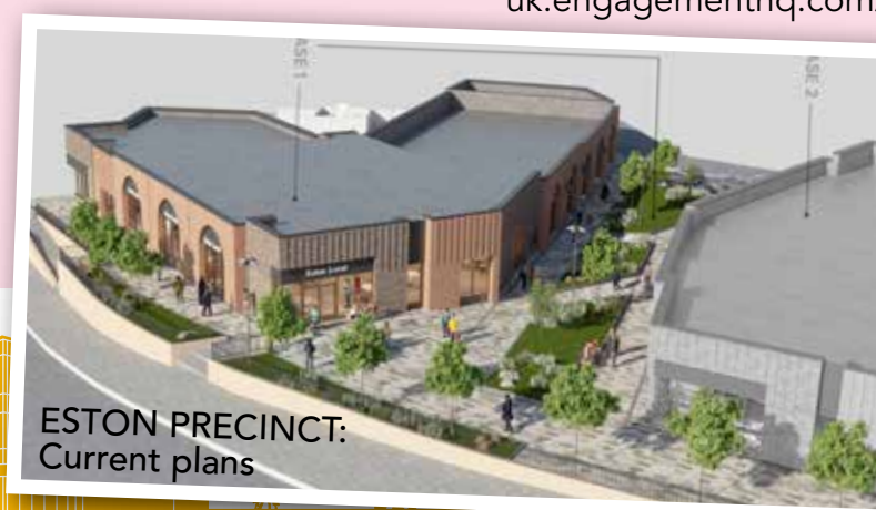
ESTON PRECINCT: Current plans

You can read more about the project, which is funded by Government and Tees Valley Combined Authority, here: https://redcarcleveland.uk/engagementhq.com/