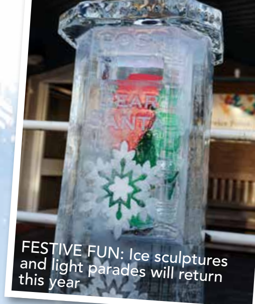
FESTIVE FUN: Ice sculptures and light parades will return this year

Your guide to all the festive fun in your towns and villages