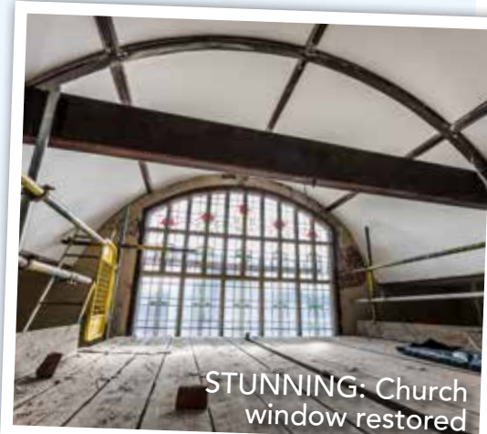
STUNNING: Church window restored

The beautiful stained-glass window (pictured) was