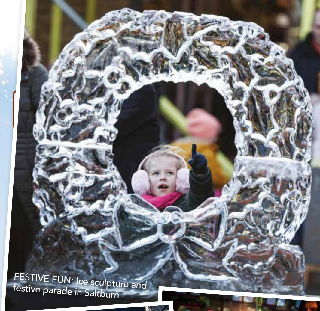
FESTIVE FUN: Ice sculpture and festive parade in Saltburn

New Year parties Guisborough Thur 23 and Fri 24 Jan Guisborough Town Council brings you two New Year parties. Enjoy musical entertainment and afternoon tea served to parish residents aged 70 and over only. Admission is free but tickets can be obtained in advance. Ring Sunnyfield House on 01287 634595.