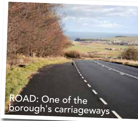
ROAD: One of the borough's carriageways

Other statistics submitted to the Department for Transport showed that just 1% of A Roads, 4% of B and C Roads and 9% of unclassified roads needed attention, placing the borough in the top five in the country for carriageway condition.